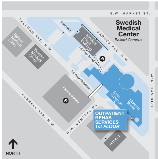
Swedish Medical Center/Ballard Outpatient Rehabilitation Services 5300 Tallman Ave. N.W. Seattle, WA 98107 T 206-781-6346