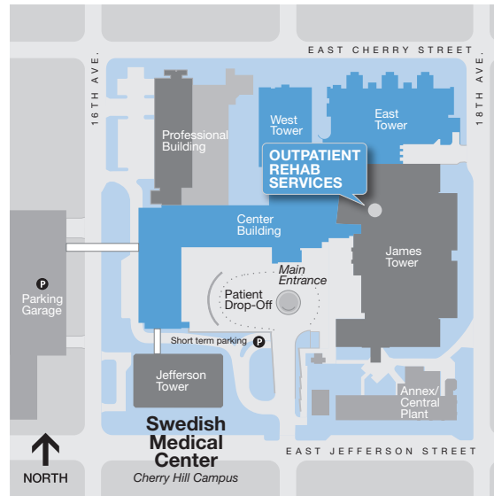
Swedish Medical Center/Cherry Hill Outpatient Rehabilitation Services 500 17th Ave., James Tower, Suite 100 Seattle, WA 98122 T 206-320-2404